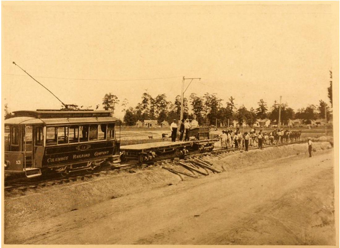
Columbus Railroad Company's electric car system comes to Waverly Terrace. The Home Book (1917)