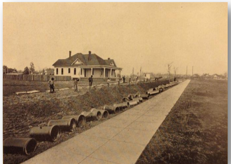
Waverly Terrace in transition. The Home Book , 1917.

Linked to downtown Columbus by a street car service, Waverly Terrace was the first planned residential suburb in Columbus. The plan included all utilities, water, sewer, and electric power lines. It also included a neighborhood elementary school. The streets were laid out, graded, and included sidewalks and numerous trees planted along each street.